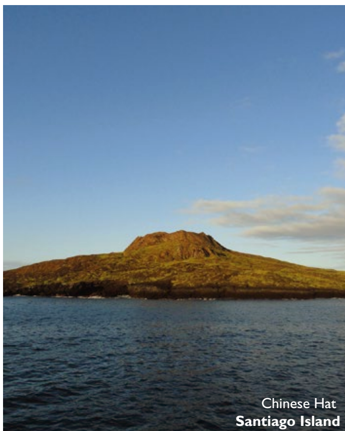
Chinese Hat Santiago Island

The road to the highlands leaves from Bellavista, a small village located a 15-minute drive from Puerto Ayora, and passes through the agricultural zone, near the National Park boundary, the Miconia Zone, and then goes to the Fern and Sedge zone. With clear weather, this area boasts beautiful scenes of rolling hills and extinct volcanic cones covered with grass and lush greenery all year round. Here you will visit the Twin Craters, which are two pit craters, as well as a local ranch where we can observe the giant tortoise of Santa Cruz Island in its natural habitat.