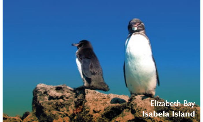
Elizabeth Bay Isabela Island