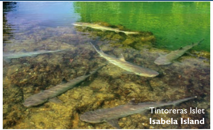
Tintoreras Islet Isabela Island

This is a marine visitor site, so the excursion has no landing point. Your zodiac ride starts with a visit to the Marielas islets where the largest and most important penguin colony reside in the Galapagos Islands. The excursion continues into the cove, surrounded by red mangroves where you can admire their red roots and green leaves. Here, you are able to observe sea turtles, flightless cormorants, spotted eagle rays, golden rays, brown pelicans and sea lions. Frequent visitors have been able to see Galapagos hawks soaring overhead with schools of pompano and dorado fish swimming down below.